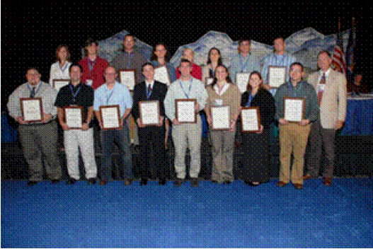
2006 Skinner Award winners.

Iowa State University University of North Carolina-Wilmington